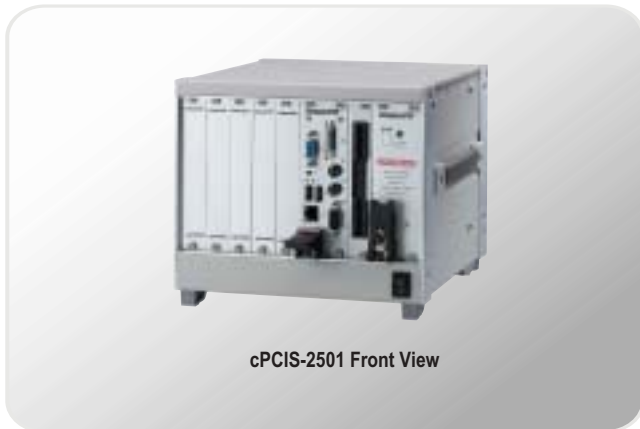
cPCIS-2501 Front View